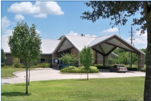
Learning Activity Center