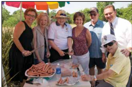
Cy-Fair Rotarians grill hot dogs for the clients at the Reach Picnic.