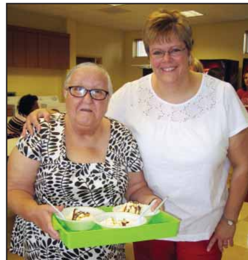
On cooking day, clients enjoy making their own sundaes with the help of National Charity League.